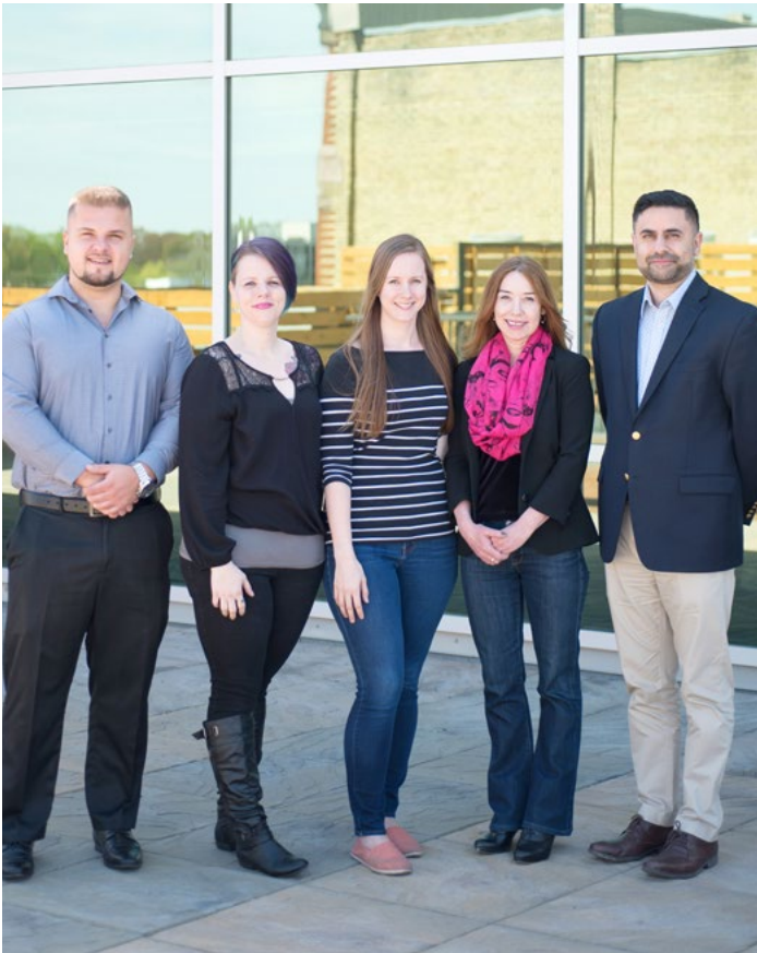
The Cornerstone Counselling Team

This past spring, LHSC unveiled a donor-supported pilot project called Cornerstone Counselling aimed at improving the system of mental health and addictions care for transition age youth (16-25 years). Cornerstone Counselling is delivered at Youth Opportunities Unlimited (YOU) in partnership with Canadian Mental Health Association – Middlesex, Addiction Services of Thames Valley and mindyourmind, an organization aimed at improving mental health care and wellness for youth and young adults.