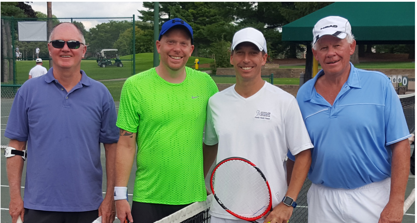
Attendees of the Fowler Kennedy Charity Tennis Classic

I'm excited for 2017 and the new opportunities that will arise. Thank you for your continued support!" ■